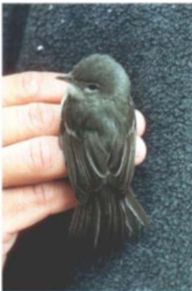
Figure 3. Bell's Vireo, Southeast Farallon Island, 18 September 1993. Two individuals of this species arrived within three days in 1992 and represent the only records of it for the island. This one appears too green to have been the California subspecies, the Least Bell's Vireo, Vireo bellii pusillus .