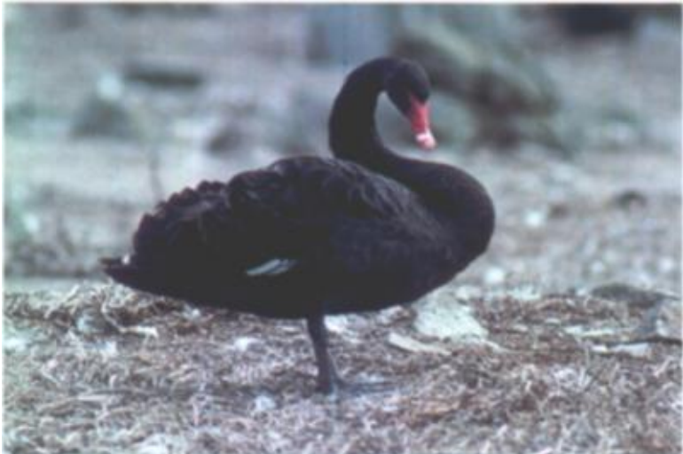
Figure 6. Black Swan, Southeast Farallon Island, 21 September 1991. This individual, presumably an escapee from captivity, was very tame, accepting hand-offered food. It died on the island on 25 September.