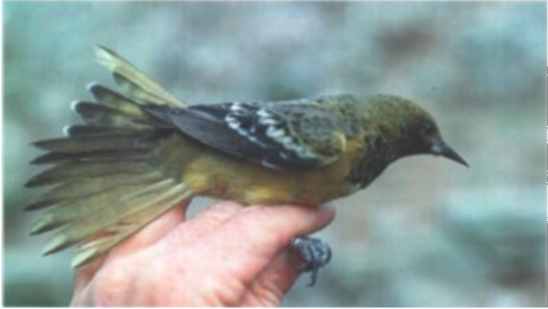
Figure 5. Scott's Oriole, Southeast Farallon Island, 10 November 1993. Two Scott's Orioles arrived on Southeast Farallon in 1993, representing the species' second and third island records.