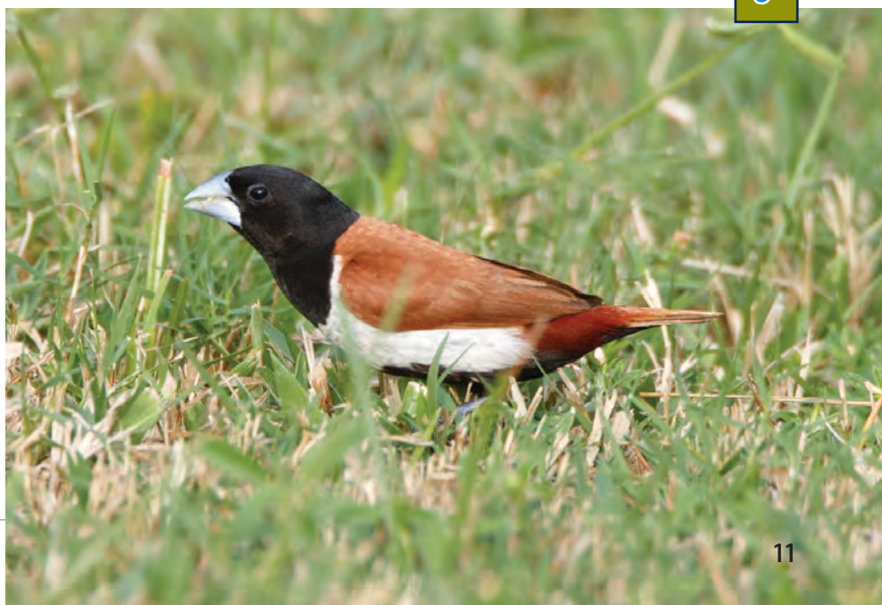
Figure 4 • Tricolored Munia. 17 Dec 2013. Dry Tortugas, Florida.

Eurasian Sparrowhawk ( Accipiter nisus )—ABA-CLC Record #2018–02 (4-4, Sep 2019; 5-3, June 2020; 6-2, Aug 2020). At the request of the observer, the ABA-CLC considered and decided to circulate a report of a Eurasian Sparrowhawk from Adak Island, Alaska, 21 Sep 2016 (Fig. 5; see Pyle et al. 2019). The record includes two photographs of the upperparts, partially obscured by vegetation, and an analysis by the observer of the bird's size that concluded that it was too small for a Northern Goshawk ( A. gentilis ), the most likely contending species. The Alaska Checklist Committee deliberated over this record in 2017 and considered it likely correct but, despite support of the identification from Eurasian raptor experts, considered the documentation not substantiated enough to add the species to the state list. Despite slowly gaining support through three rounds of voting, the record failed to be accepted to the ABA Checklist by the ABA-CLC on the third and final round, by a 6-2 vote. Supporters of the record pointed to several field marks that, alone or when combined, eliminated Northern Goshawk (see