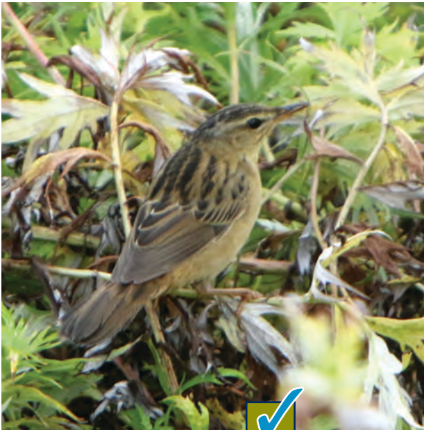
Figure 3 • Pallas's Grasshopper-Warbler. 10 Sep 2019. Gambell, Alaska.

Peter Kennerley and Chris Goodie, who also noted no signs of hybridism with Middendorff's Grasshopper-Warbler ( H. ochotensis ); hybridization has been reported from the lower Amur River basin of Siberia (Kennerley and Pearson 2010). Although subspecies could not be determined, the bird's appearance was consistent with the northernmost breeding subspecies and longest-distance migrant, H. c. rubescens . Nomenclature follows that of the American Ornithological Society (Chesser et al. 2020), who changed this genus from Locustella to Helopsaltes ; and, following Clements et al. (2019), the Pallas's Grasshopper-Warbler is listed prior to Middendorff's Grasshopper-Warbler as the first species of Family Locustellidae in the ABA Checklist sequence. It is given ABA Code 5.