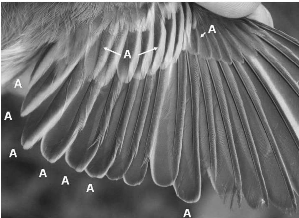
Fig. 1. Right wing of an adult male Yellow Warbler captured for banding at the Braddock Bay Bird Observatory banding station, showing alternate (“A”) inner secondaries (s4-s9) along with p1 and its corresponding primary covert.

as an adult (after second calendar year) male based on characteristics of the primary coverts, rectrices, and body plumage (Pyle 1997b). We identified the extent of the prealternate molt based on molt limits, the replaced alternate feathers being brighter edged and looser in texture than the retained basic feathers (cf. Figs. 1-2). On both wings the prealternate molt included all secondary (lesser, median, greater, carpal, and alula) coverts and six inner secondaries (s4-s9), representing a more-extensive prealternate molt in Yellow Warblers than documented by Pyle (1997a). Two rectrices on the left side, r3 and r5, had apparently been replaced adventitiously since the complete prebasic molt the previous summer; otherwise, no rectrices had been replaced during the prealternate molt. On the right wing the innermost primary (p1) and its corresponding primary covert had been replaced (Fig. 1) and on the left wing the innermost two primaries (p1-p2) and their corresponding primary coverts had been replaced (Fig. 2). The symmetrical nature of this primary and primary covert replacement, including