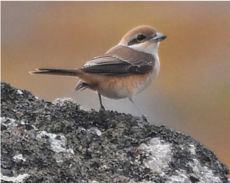
Figure 9. The sixth fall record, and seventh overall, of Brown Shrike at Gambell was established by this individual on 20 September 2018. In comparison to Red-backed Shrike, it shows a larger, thicker-based bill with a grayish (rather than yellowish) base and slightly convex lower mandible, as well as a blackish (rather than rusty-brown) auricular patch.

for Alaska and North America (Gibson and Withrow 2015, Pyle et al. 2015). As summarized by Worfolk (2000), Brown Shrikes “show the longest and deepest bill, the shortest wing, and the longest, narrowest, and most graduated tail,” (fig 8) in combination creating a different impression than that shown by the Gambell shrike. Brown Shrike appears to show a larger head and longer- and narrower-tail than does Red-backed Shrike, and often (but not always) they have an obviously shorter primary projection beyond the longest tertial. They have a subtly deeper-based bill, often with a somewhat convex rather than straight lower mandible, and grayer coloration at the base (fig 8).