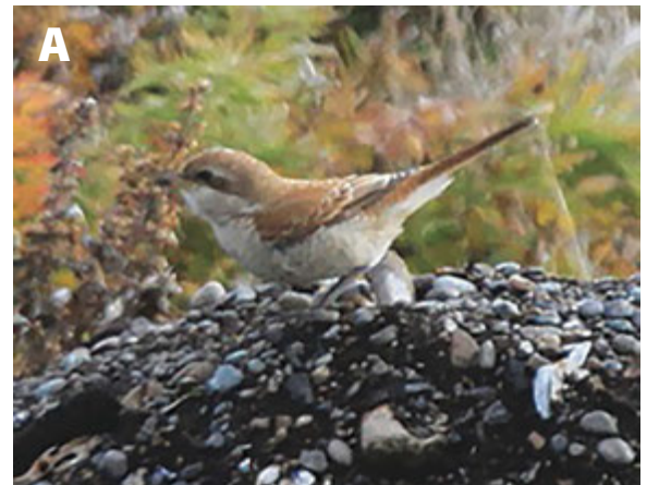
Figures 10A–B. These two photos show more typical field views of the Gambell Red-backed Shrike on 7 Oct 2017 (A) and of a first-fall Brown Shrike at Gambell on 29 Aug 2014 (B). Compared to the Red-backed Shrike, the Brown Shrike lacks a gray nape, has a thicker bill, weaker vermiculations above, a blacker face-mask, and shows slightly shorter primary projection. This photo of the Gambell Red-backed Shrike was the first distributed off-island by Lehman and is the image which first alerted Hough that a Red-backed Shrike rather than a Brown Shrike might be involved.

Turkestan Shrike has a long primary projection, although not quite as long as Red-backed, with the tip of p9 falling between p5 and p6 and a ratio of p8–p9/p9–primary coverts being 0.136–0.230 (Pyle et al.