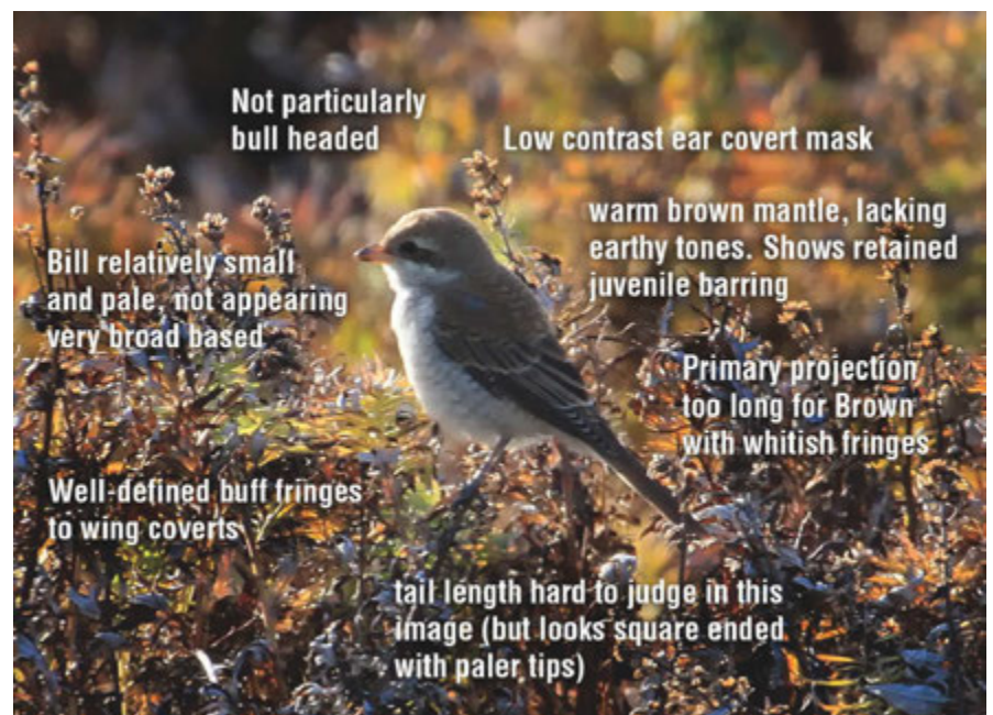
Figure 2. This enlarged image of the Gambell shrike, taken on 8 October 2017, was the first higher quality photo obtained of the bird. Upon receipt of this photo, Hough added the annotations seen here, explaining many of the reasons he believed the bird was, in fact, a Red-backed Shrike.

• SIZE, SHAPE, AND SOFT PARTS: A shrike in overall shape, proportions, and bill (fig. 1-6), but small in comparison to e.g., Northern Shrike ( L. borealis ). The head appeared somewhat rounded rather than blocky. The bill appeared noticeably slighter