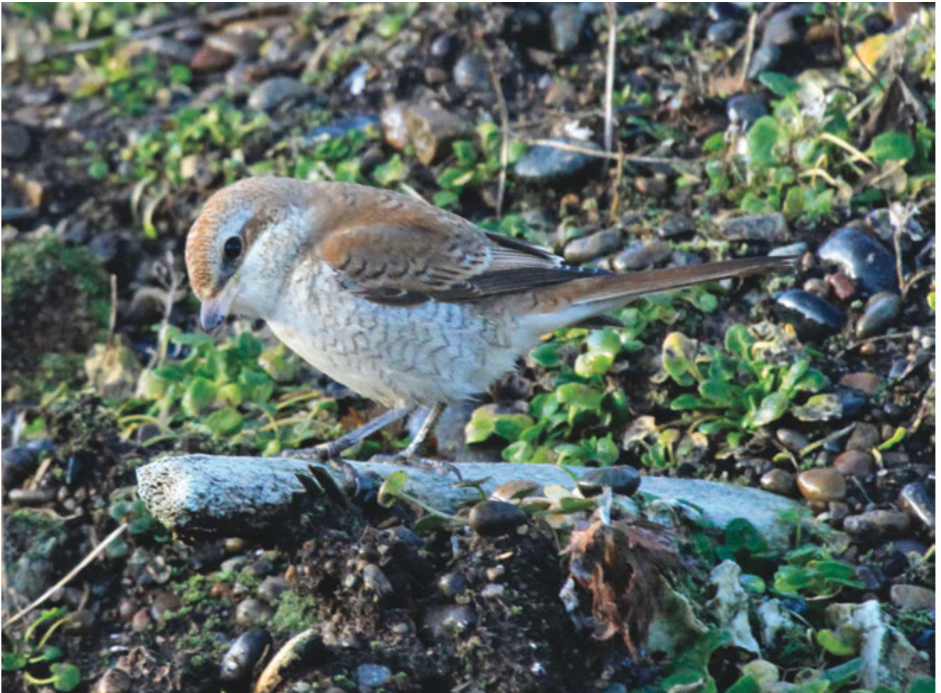
Figure 4. This photo of the Gambell Red-backed Shrike on 14 Oct 2017 captures many important characters: a low-contrast, rusty mask, distinct and extensive dark vermiculations both above and below, and a pale gray nape.

past the tertials—not including the outmost two primaries (p9 and p10) that have tips falling beneath the others. This count depended on how spread the wing was. The shrike often sat with partially-spread wings (fig 1, 3, and 6) showing eight exposed tips (p1–p8), but when the wing was fully folded it appeared that six (p3–p8) or seven (p2–p8) tips fell beyond the tertials (fig 4). Due to variation in the wing spread in situ and the intrinsic length of the longest tertial (s7) among individuals, and due to wear and molt, a better means of assessing wing morphology is through the relative lengths of the outer primaries. Important to the identification of Eurasian shrikes is the length of p9 relative to those of the other primaries. Several images clearly show the tip of p9 to fall about even with that of p6, those taken from behind showing it slightly shorter (fig 3) but those taken perpendicular to the wing angle showing the tips of p9 and p6 almost exactly even in length (fig 1 and 6).