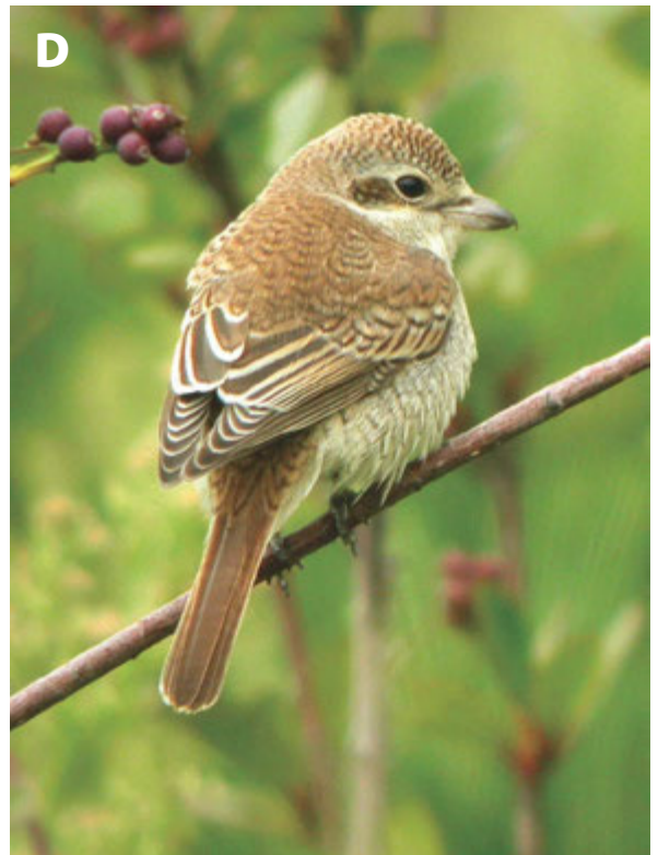
Figures 11A–D. Typical juvenile or first-fall Turkestan Shrikes (A, Khazakistan, 18 June 2013; and B, Israel, September 2014) and Red-backed Shrikes (C, Bulgaria, 22 September 2004; and D, South Korea, 30 September 2009). Note the much grayer backs of the Turkestan Shrikes, lacking contrast with the nape and crown but including a distinct contrast with the redder tail. Red-backed Shrikes, by contrast, show a slightly grayer nape, contrasting with the crown and back, but show little contrast between the back and tail. Note also the less distinct dark vermiculations to the back and the lack of reddish in the auriculars of the juvenile and first-fall Turkestan Shrikes, at odds with typical Red-backed Shrikes and the Gambell bird.