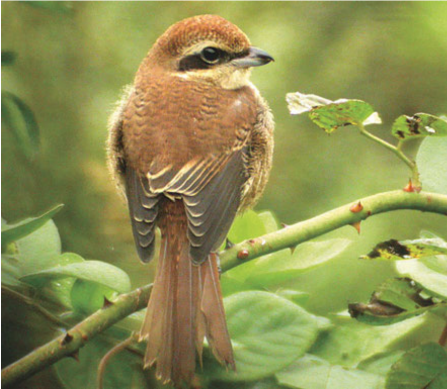
Figure 8. A first-year Brown Shrike, South Korea, 3 September 2003, showing typical features of the nominate subspecies. Compared to first-fall Red-backed Shrikes and the Gambell bird, note the shorter primary projection (six primary tips visible on a partially opened wing), lack of gray in the nape, the bolder, blacker face-mask, and the grayish base to the bill.