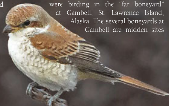
Figure 1. The Gambell, Alaska, Red-backed Shrike photographed on 10 Oct 2017.

that provide exposed, rich soil, some degree of protection from the wind, and (by late summer and early autumn) a relatively lush growth of two species of Artemisia . Known colloquially as wormwood or sage, this vegetation grows to a height of approximately a half-meter or more. The food and cover provided by the middens are attractive to both Asian and North American landbird migrants, including many vagrant species. Rosenberg flushed a mid-size brownish passerine out of a digging pit immediately in front of him; the bird then perched very close by on the rim of the pit for a second or two before flushing again and flying a long distance away. As it departed, he yelled “Brown Shrike!” Bryer and Lehman turned to see the bird flying away. It then perched for an extended period of time on a fence some 100–125 yards distant. It indeed resembled a Brown Shrike ( L. cristatus ) in general features but was much