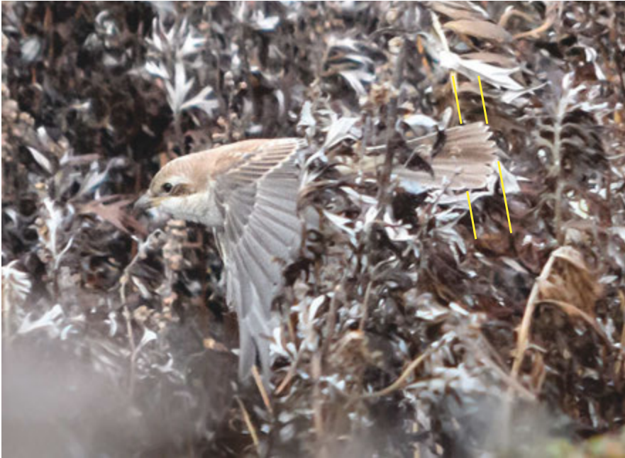
Figure 5. The Gambell Red-backed Shrike in flight, 10 Oct 2017. Note the wing and tail morphology including un-emarginated p6 and relatively long and broad outer rectrix, as compared with that of Brown Shrike. See Figure 7C, right, for details.

the pale yellowish to pinkish bill base of the Gambell shrike clearly indicated that it was a first-fall bird. Careful scrutiny of the images indicated that the bird was still largely in juvenile plumage but with scattered newer formative feathers present in the crown, scapular tract, and among the lesser coverts (fig 1, 3, 4, and 6). These formative feathers were reddish-brown and either lacked or showed very indistinct barring, contrasting with the more worn and heavily barred juvenile feathers. Some newer white formative feathers, without barring, may also have been present in the supercilium, malar region, throat, and breast, while some new blackish feathers may have been present in the lores and auriculars. The preformative molt in these shrikes can begin on the summer grounds, suspend for migration, and continue at stop-over locations (Pyle et al. 2015), and it appears that this bird had replaced some juvenile feathers before reaching Gambell.