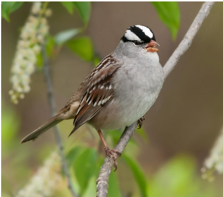
White-crowned Sparrow, one of the species that was shown to have persistent impacts to survival from West Nile virus, according to a new study by IBP and other researchers.

The study grew out of a long partnership between IBP and the UCLA Center for Tropical Research that focused on the effects of introduced infectious diseases on bird populations. All avian data used in the paper were gathered from IBP's Monitoring Avian Productivity and Survivorship ( MAPS Program ), a continent-wide network of bird banding stations operated by thousands of professional biologists and