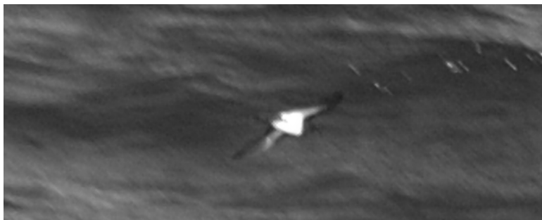
Figure 1. Fregetta storm-petrel, presumed White-bellied Storm-Petrel ( F. grallaria ), 456 km SE of Isla Clarion, Mexico (14° 50.52' N, 112° 35.46' W), 29 November 2006. Note the apparently entirely white belly and white underwing coverts contrasting with the blackish breast and head.

The bird was a small storm-petrel, appearing slightly larger in size than a Wilson's Storm-Petrel ( Oceanites oceanicus ), although no other birds were nearby at the time for comparison. It propelled itself with its feet, leaving small "rooster-tailed" splashes on the water (Figure 2), a characteristic of Fregetta and closely related genera of storm-petrels. The storm-petrel appeared to have a dark throat, a square or rounded tail, clear white underparts, white underwing coverts, and white uppertail coverts.