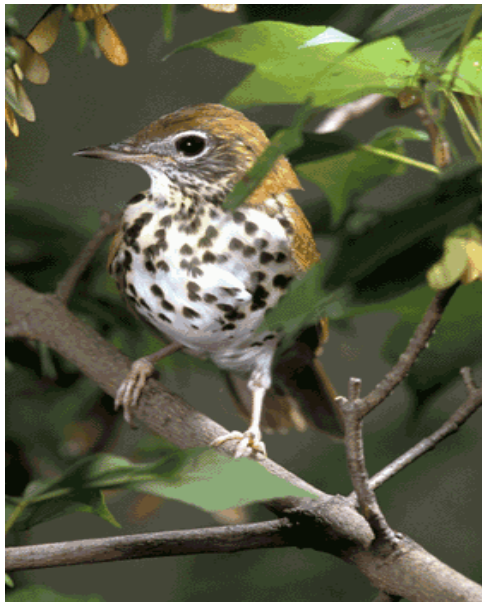
Figure 3. Wood Thrush ( Hylocichla mustelina ), an open forest floor specialist.

In addition, we recommend the continued operation of stations at Fort Lewis, Fern Ridge Lake, Hunter-Liggett, Vandenberg AFB, Camp Roberts, and Fort Sill, because they have high capture rates of many species including Pacific-slope Flycatcher, Wrentit, California Towhee, and Winter Wren.