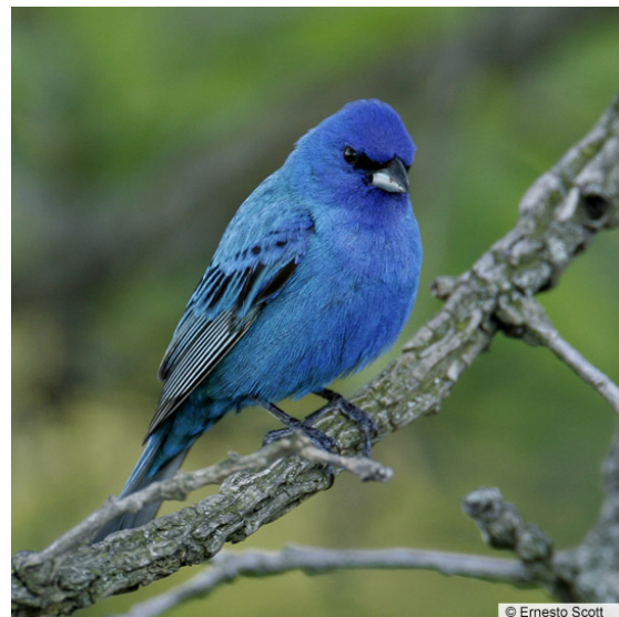
Figure 4. Indigo Bunting ( Passerina cyanea ) prefers weedy/shrubby successional habitats.

As reported in analyses of Legacy-funded MAPS station data (Nott et al. 2003) healthy avian populations can be associated with military lands upon which the objectives of Readiness and Range Sustainment are consistent with providing large military training areas buffered from adjacent private lands. The overall goal is to manage such areas to maximize training opportunities, reduce the risk of wildfire, and protect natural resources.