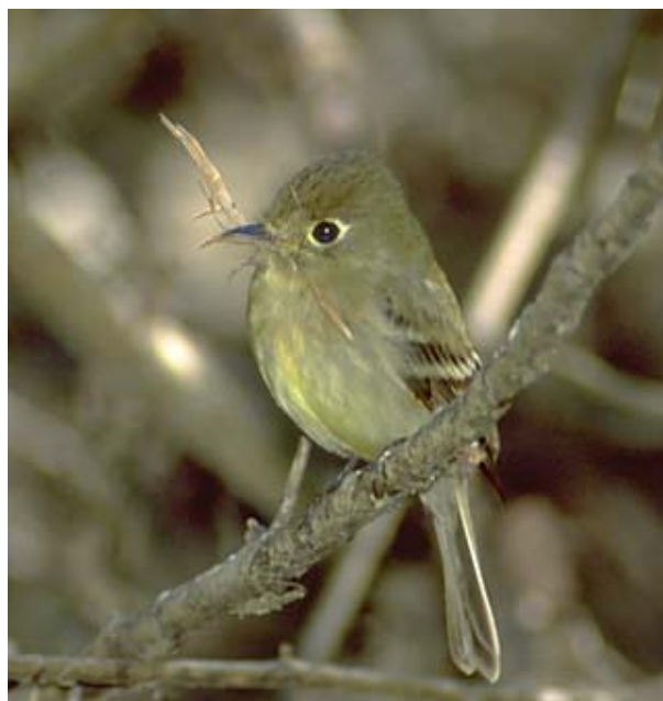
Figure 2. Pacific-slope Flycatcher ( Empidonax difficilis ) collecting nesting material.

In the Pacific Avifaunal Biome , seven survival rate estimates exceeded the mean estimates for the biome. Of the three species of continental importance featured in this biome (Table 1), only the survival rate of the Pacific-slope Flycatcher (0.468) exceeded that of the mean BCR survival rate estimate (0.459). Although the estimate was lower than the Northern Pacific Rainforest (BCR 5) estimate (0.508), California stations mainly contributed to the estimate which was higher than the Coastal Californian (BCR 32) estimate of 0.410.