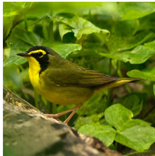
Kentucky Warbler, one of eight species analyzed in the new paper by Rushing et al.

Ecologists have long recognized that the factors shaping the distribution and abundance of species operate on at least two spatial scales. At the local scale, immigration and emigration are the primary drivers of population dynamics, making local populations vulnerable to extinction or