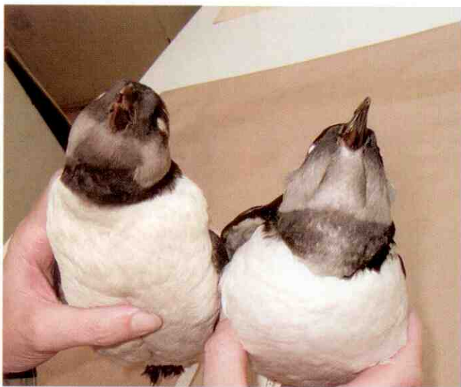
Fig. 2. Two comparisons of first-year Horned (top & left) and Atlantic (bottom & right) Puffins. Adult Horned Puffins have a blackish chin and throat, whereas adult Atlantic Puffins have the grayish malar region and chin separated from the white breast by a distinct dark band. These features are also shown by first-year birds, although somewhat less distinctly. The combination of blacker upperparts and breast with a more-distinct breast band and paler throat should allow separation of most first-year Atlantic from first-year Horned Puffins at sea. Differences in bill shape (see Sibley 2000) begin to be expressed in second-year and older birds. Horned Puffin : collected in September in Alaska. Atlantic Puffin : collected in August in Iceland.

plumage aspect is attained (Fig. 7). Thus, from second-basic plumage onward, age must be inferred by bill-groove criteria. Variation in length of the eponymous horn (a keratinous protuberance) might also repay investigation as a possible aid to aging.