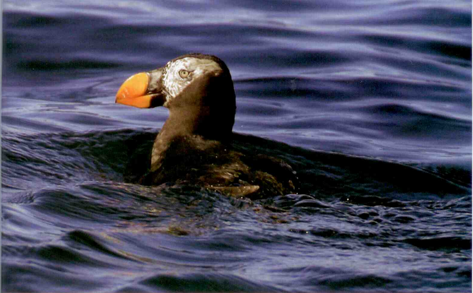
Identification of adult Horned and Tufted Puffins in breeding plumage is straightforward. But what of individuals in other plumages? In order to make sense of these more-difficult plumages, it is essential to have a basic grasp of molt and aging. The approach in this article is to examine in some detail various characters that are evident from a study of museum specimens—with the hope that the lessons learned can be put to good use at sea. Adult Tufted Puffin in transition to non-breeding plumage. Santa Cruz County, California; September 2004.