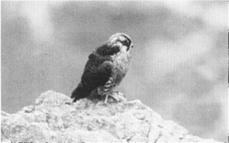
Figure 2. Immature Peregrine Falcon of the tundra subspecies F. p. tundrius , Southeast Farallon Island, 6 November 1987.